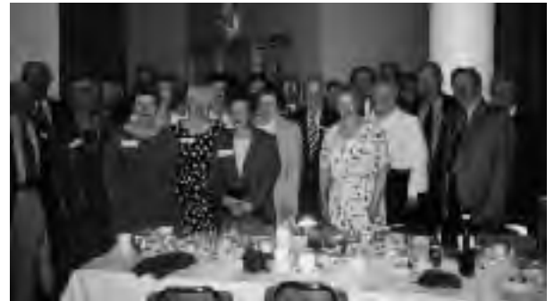
Above L to R: Class of '55 - a congenial dinner group!