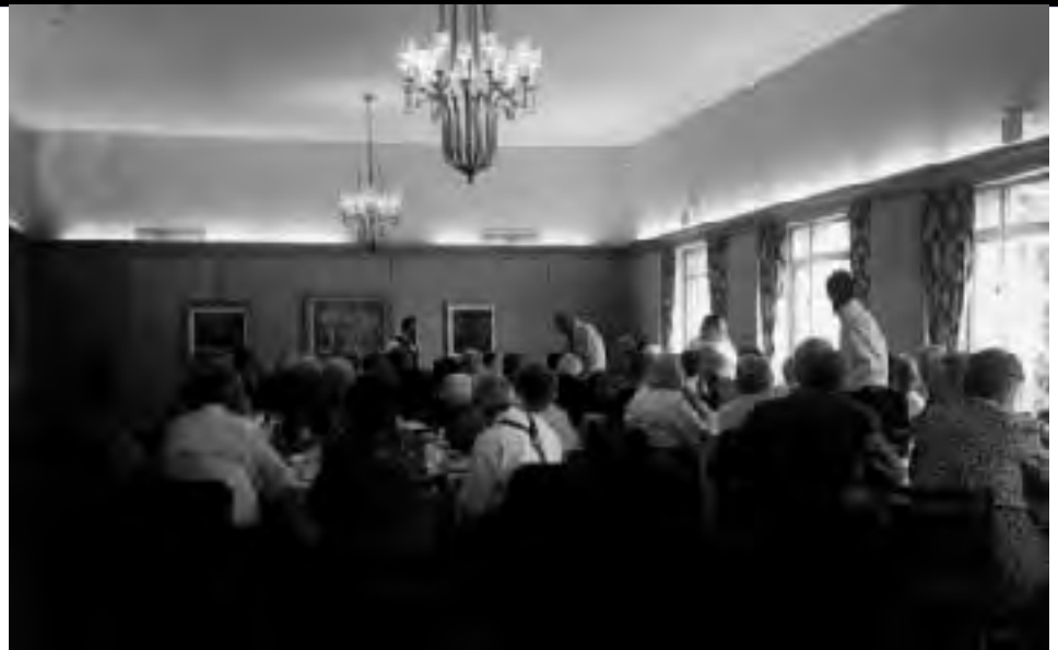
Above L to R: Class of '50 The Golden Lunch.