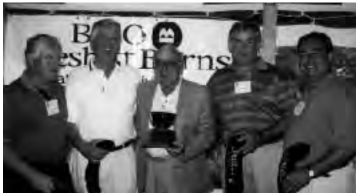
Above: New Millennium Golf Classic 1st place Golf Team.