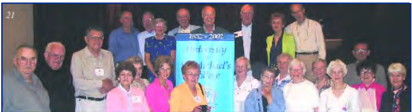
21: The Golden Anniversary Year – Class of '52