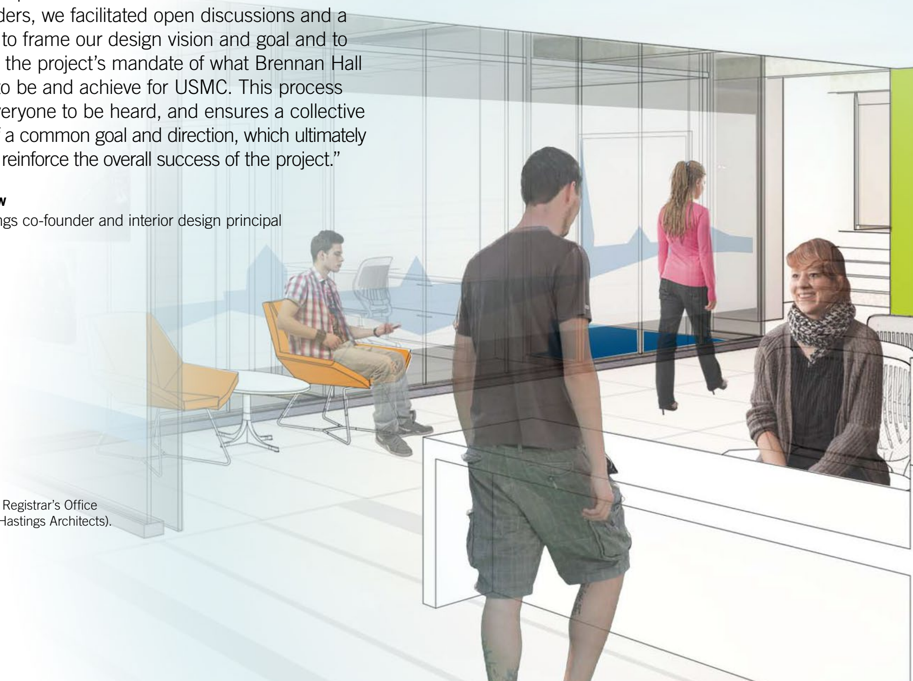
Rendering of Registrar’s Office.

Gow Hastings co-founder and interior design principal