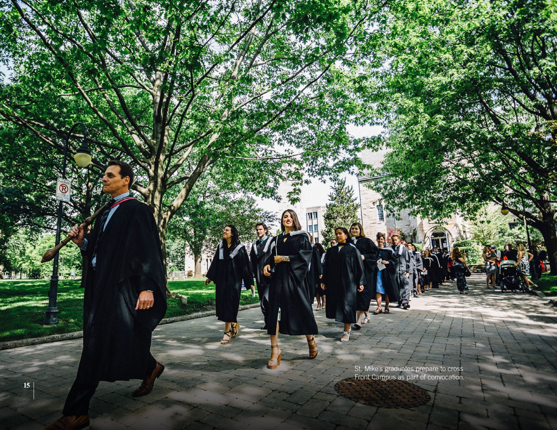
St. Mike's graduates prepare to cross Front Campus as part of convocation.