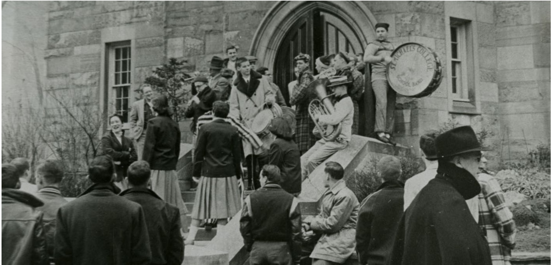
Students gather on front steps of Brennan Hall's south entrance, 1954–55 (left) and 2017–18 (right).