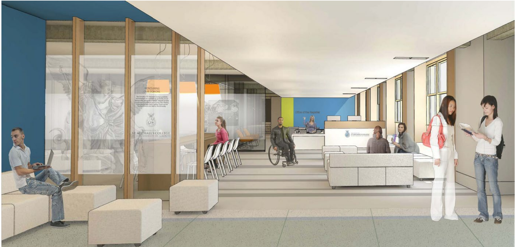
Rendering of Lobby with view of Registrar's Reception (credit: Gow Hastings Architects).