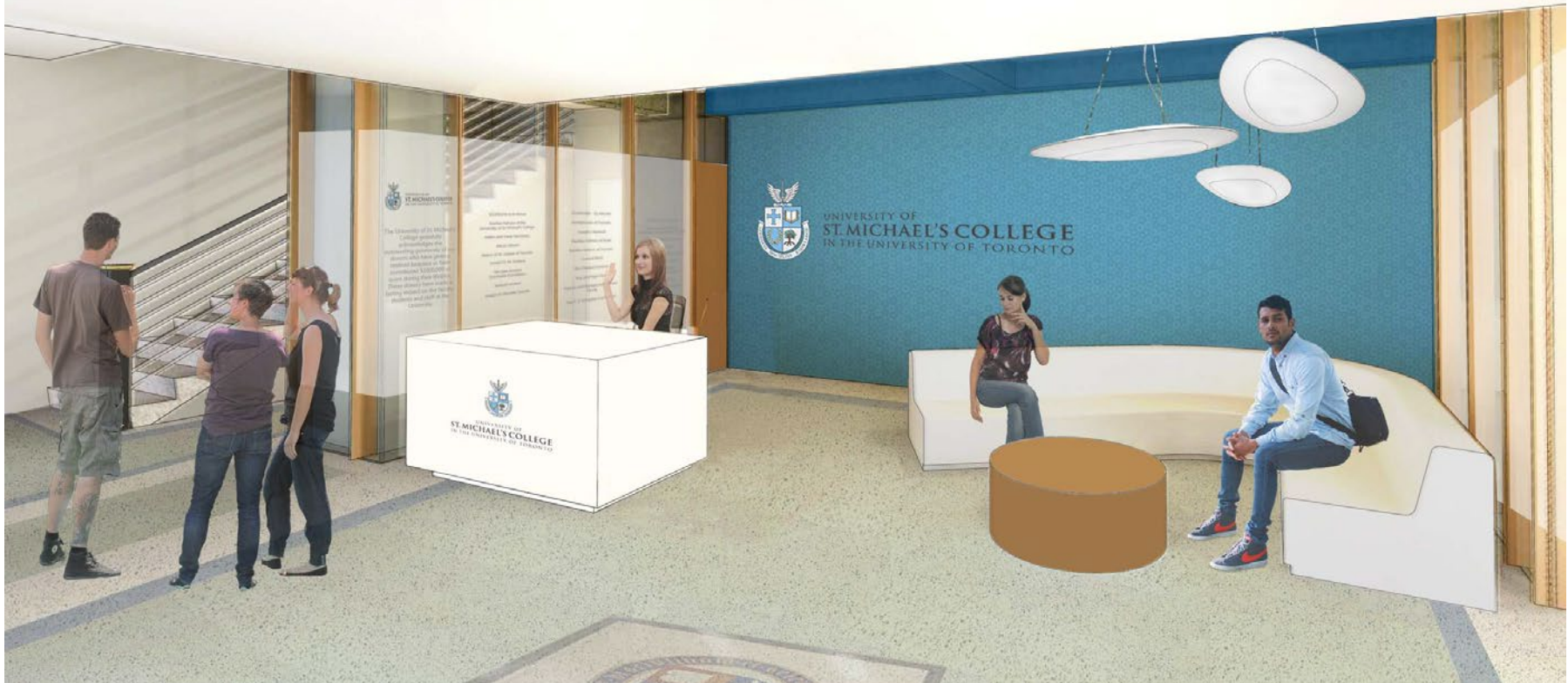
Rendering of Lobby with view of Welcome Desk (credit: Gow Hastings Architects).