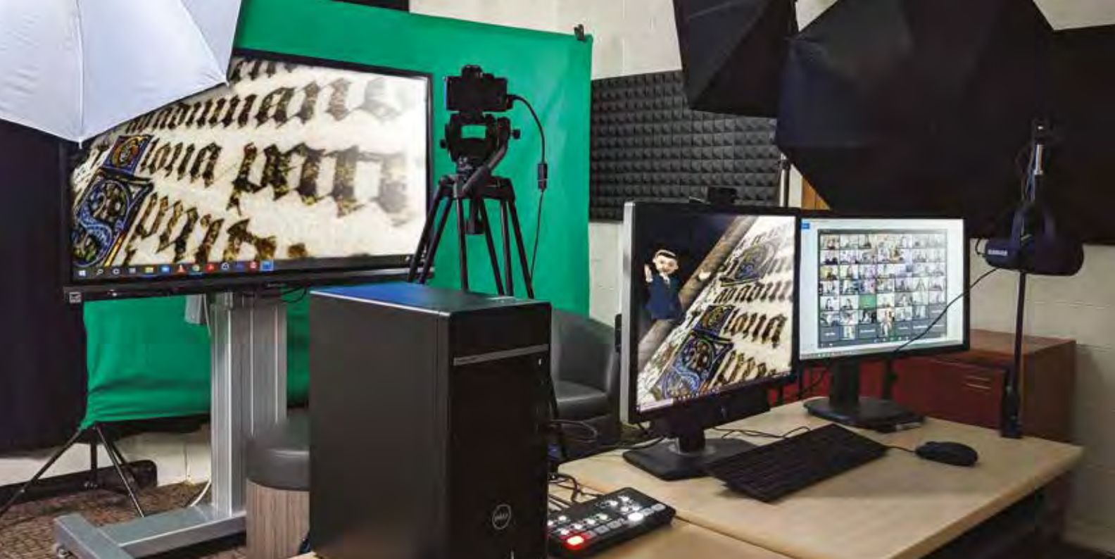
The Global Classroom offers students a virtual hands-on experience exploring the Scriptorium.