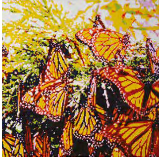
Matt Donovan, "Monarchs 2," 2016, Lego, 63" x 63", The Donovan Collection