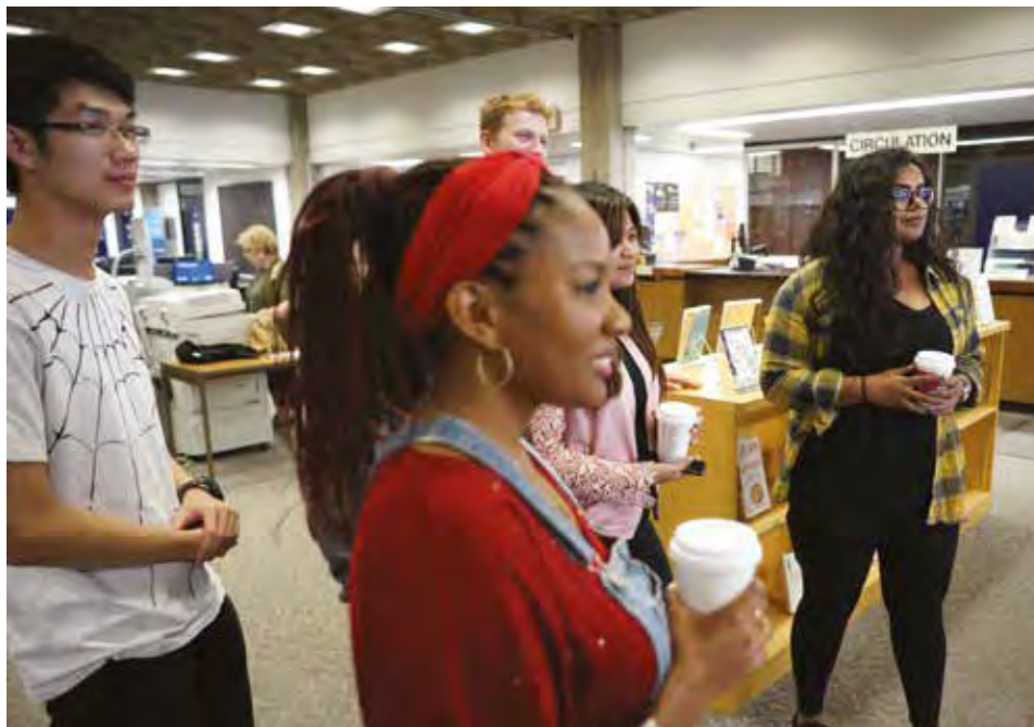
Left: Students appreciate the John M. Kelly Library's many roles.