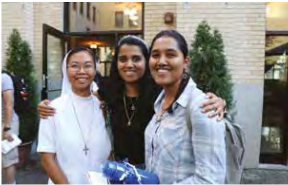
Faculty of Theology students are a close community within the Toronto School of Theology.