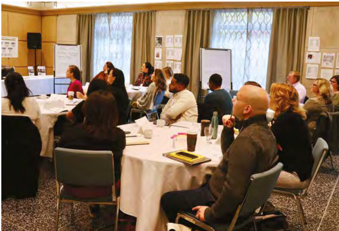
SR&S students shared their wisdom and skills on a project benefitting people thousands of kilometres away.