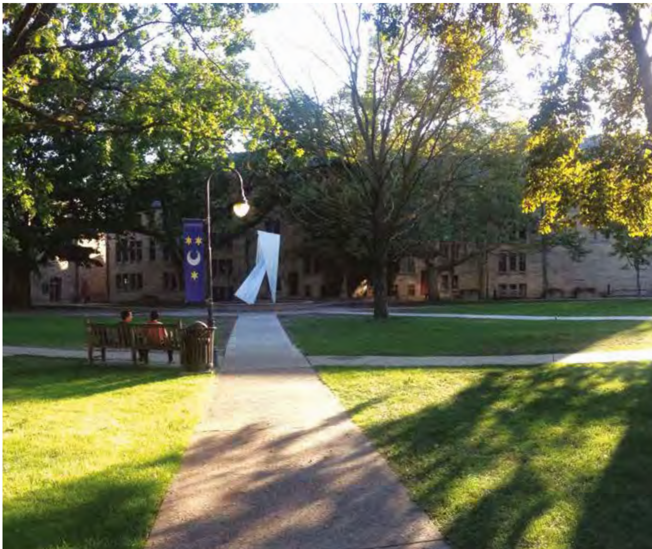
Learning from each other is a key aspect of life at St. Michael's.

“There is a maturity about these students that is really impressive. When they identify issues that are adversely affecting students’ mental health, they offer thoughtful and creative recommendations on how they can be addressed,” he says.